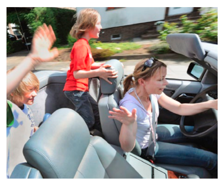
The dog and the baby cause distraction: your own kids have top priority, even in the car. As a parent, you always react to certain behaviour or signals from your children. The resultant control glances contribute to distraction.

True: drivers are often distracted without the presence of any physical distractor. Three-quarters of respondents to the Allianz survey admitted to sometimes letting their thoughts wander while they are driving. Others have felt angry or extremely stressed when at the wheel. Such inner disturbances are often causes of "looked but failed to see" accidents. In such a situation the driver is looking at the road, but his mind is somewhere else.