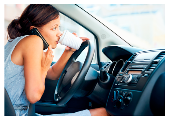
The risk of having an accident increases when the driver is busy with manual tasks: 43% of those surveyed, who had been involved in an accident within the last three years, reported using the phone while driving. Of those surveyed who have not had an accident, this number was only 26%